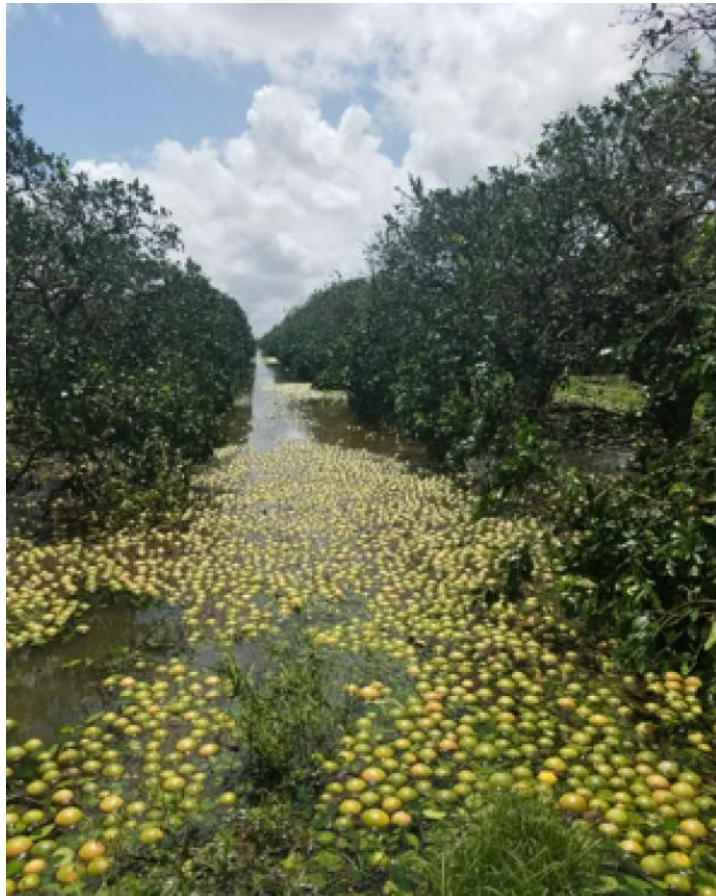
Florida Fruit and Vegetable Association